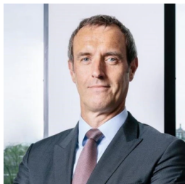
Sir Rob Wainwright Executive Director Europol / Partner