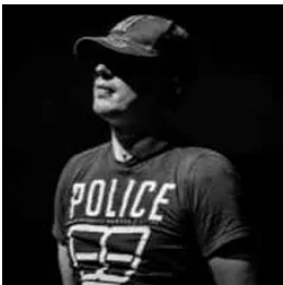
FC Ethical Hacker / Partner