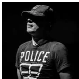
FC Ethical Hacker / Partner