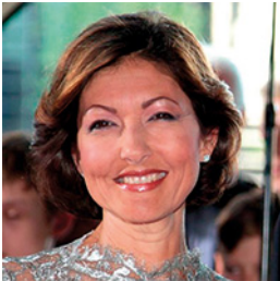
H. E. Countess of Frederiksborg, Alexandra Christina Manley / Partner